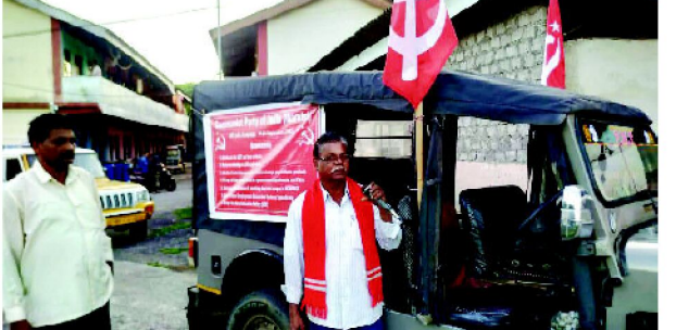
Port Blair, Sept 26: As part of the All India Campaign by the CPI (M) on "The Increasing Assaults of the BJP central government on people's livelihood", the Middle Andaman Area Committee of the CPI (M) has carried out a Mass Demonstration at Billiground Bazar on 24th September, 2022. The demands raised in the mass demonstration were (1) withdraw GST on food articles (2) restore See... Page No. 02