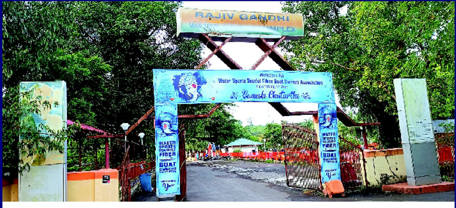
Port Blair, Sept 26: The Display board of Lord Ganesh Chaturthi celebration installed at the entrance point of Rajiv Gandhi Water Sports complex has not been removed despite conclusion of pooja celebrations. This display stand was installed by the Water Sports Tourist Fiber boat owners Association. Ideally this board should have been removed immediately on conclusion of pooja, but it is standing tall and strong as if it is a permanent board display at the venue. Managing authorities of the Park and water sports complex may look into it and do the needful removal of display board.